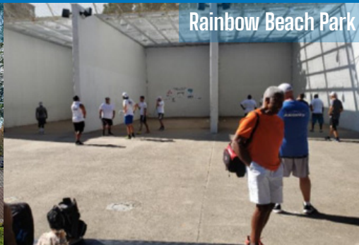
Rainbow Beach Park