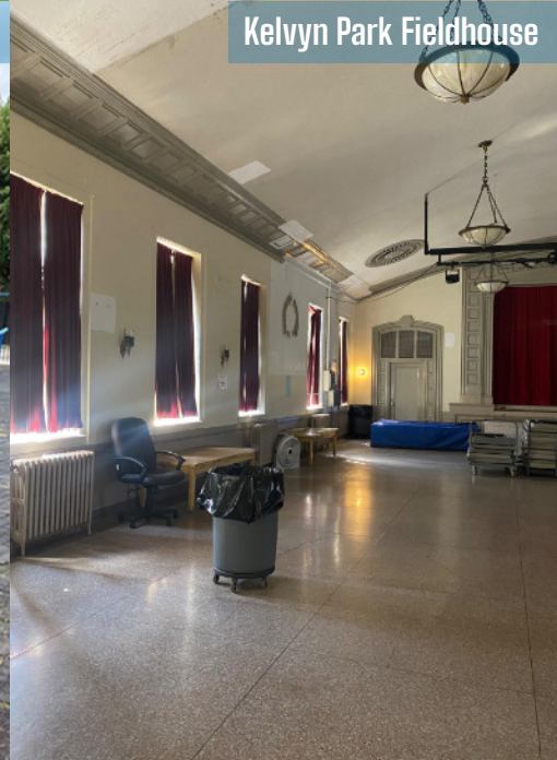
Kelvyn Park Fieldhouse